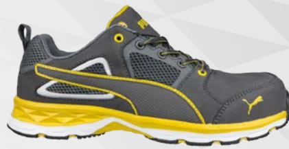
64.380.0 PACE 2.0 YELLOW LOW S1P ESD HRO SRC

Protection fiberglass cap and flexible FAP® midsole Plus ESD, metal free, reflecting elements Upper leather with breathable textile inserts Sizes 39 - 48