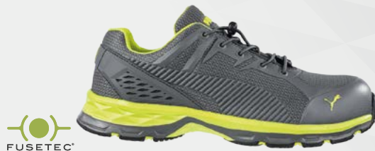
64.388.0 FUSE MOTION 2.0 GREEN LOW S1P ESD HRO SRC

Protection fiberglass cap and flexible FAP® midsole Plus ESD, metal free, toe cap protection, quick lacing system, extra pair of laces in the box Upper Sandwich-Mesh with FUSE.TEC® elements Sizes 39 - 48