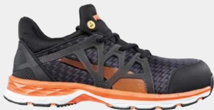
63.387.0 RUSH 2.0 MID S1P ESD HRO SRC

Protection fiberglass cap and flexible FAP® midsole Plus ESD, metal free, toe cap protection, heel support Upper durable textile with TPU strengthening, collar and dust tongue out of stretch fabric for sock-like fitting and easy entry Sizes 39 - 48