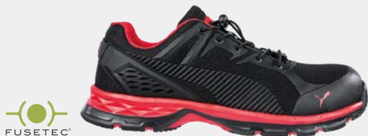
64.389.0 FUSE MOTION 2.0 RED LOW S1P ESD HRO SRC

Protection fiberglass cap and flexible FAP® midsole Plus ESD, metal free, toe cap protection, quick lacing system, extra pair of laces in the box Upper Sandwich-Mesh with FUSE.TEC® elements Sizes 39 - 48